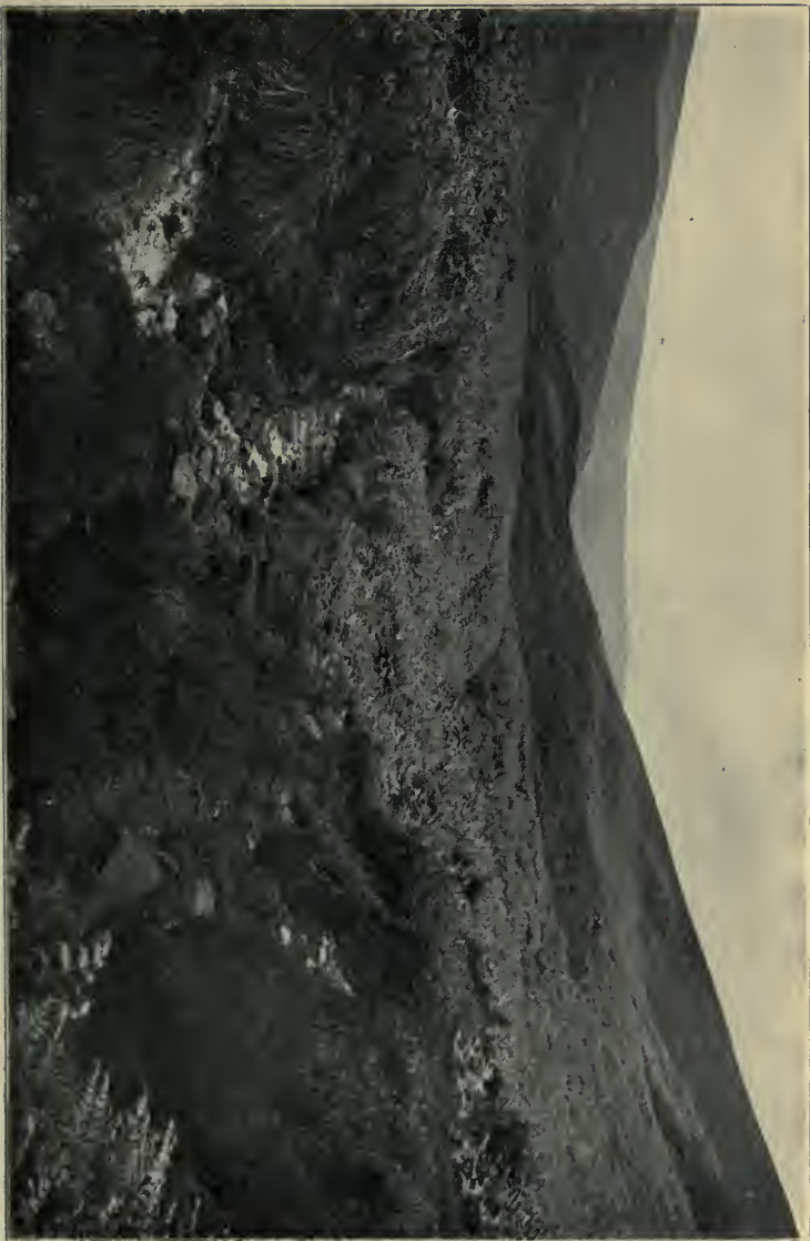
VIEW OF THE MOORS